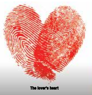
The lover's heart