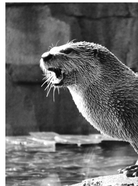
Otter