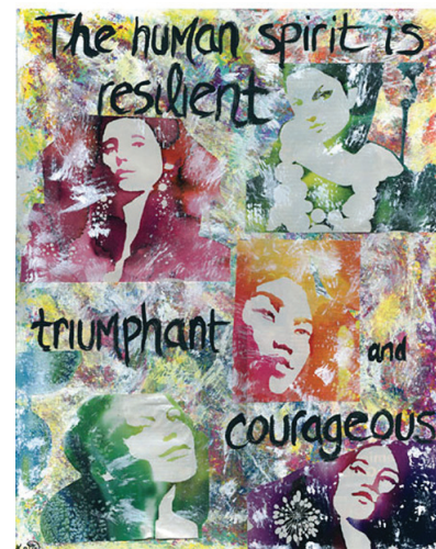
"Human Spirit" by Katie Tobias

At other times, however, we can deal with stress on our own. Many teenagers in the PH community turn to creative activities to help them blow off steam and clear their minds. You can listen to or create music, journal and write about your feelings, meditate, create artwork or write poetry. You can be as creative as you want to be! Studies show that any type of creative expression can improve your physical, mental and emotional well-